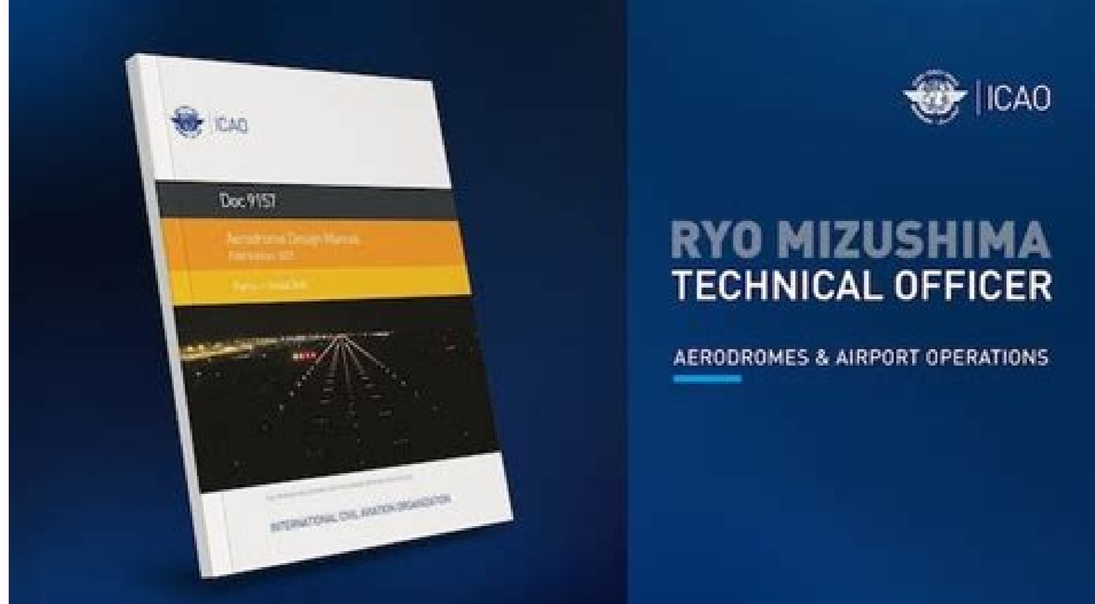
Icao aerodrome design manual part 7. Aerodrome design manual (doc 9157) part 7.